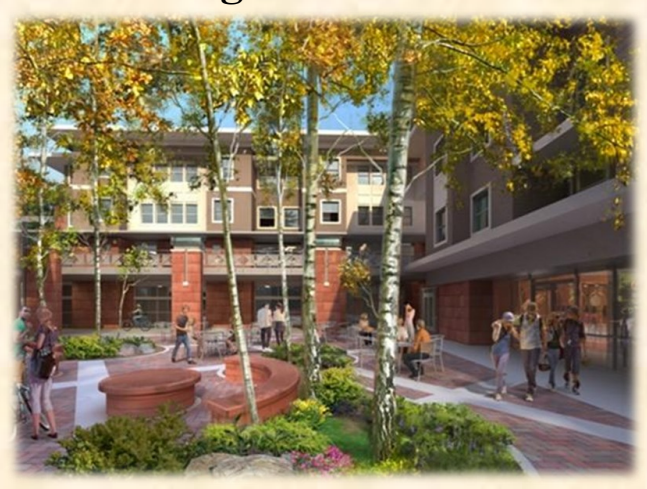
The Suites Residence Hall Northern Arizona University Flagstaff, Arizona

ASDI Invites you to our Annual Summer Retreat July 21, 22 and 23rd, 2023 at Northern Arizona University in beautiful Flagstaff Arizona.